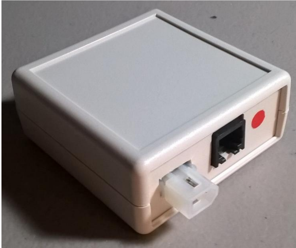
Invetex Power Booster